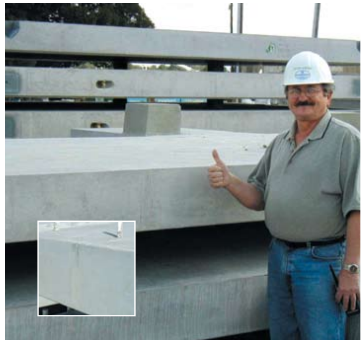
Finished precast units using Rheodynamic SCC