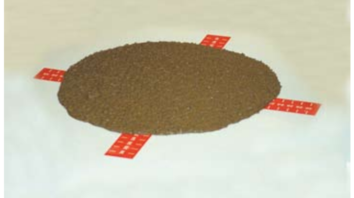
Example of 26" Slump Flow from Rheodynamic SCC Mixtures (VSI Rating of 0-High Stable)